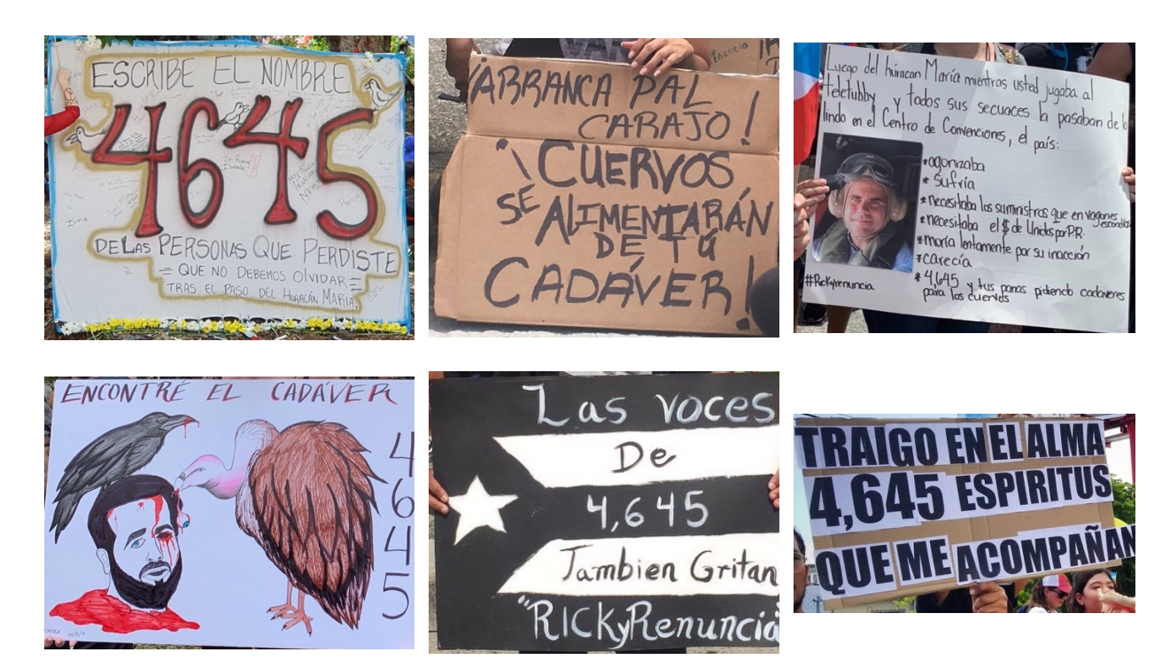
Figure 8. Sample of protest signage regarding intertextuality and Hurricane María

made in the chat regarding this issue. Another protest sign reads Traigo en el alma 4,645 espíritus que me acompañan (Own translation: I bring in my soul 4,645 spirits that accompany me), another emotional and impactful statement that appeals to Puerto Ricans that lived through the hurricane and its aftermath. The mention of cuervos rejects the comment made in the chat; there is an evident disavowal of the comment and the chat members.