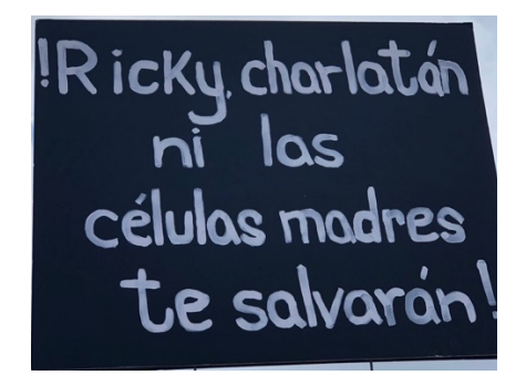
Figure 4. Sample of protest signage regarding personal attacks against Rosselló