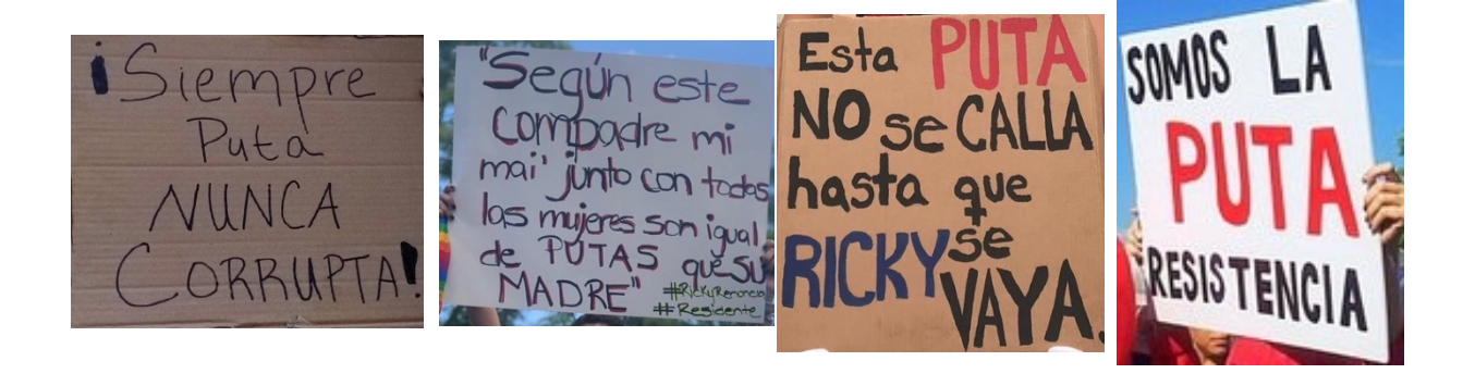
Figure 9. Sample of protest signage regarding intertextuality and misogynistic discourse

( Puertorriqueños Unidos Tomando Acción ) [Own translation: Puerto Ricans United Taking Action], widely used among protestors. Another example of appropriation of puta is women reclaiming the term as a symbol of resistance, pride and revolution. Claiming the slur puta is an evident statement of power shift and provocation by women protestors. One sign reads Esta puta no se calla hasta que Ricky se vaya (Own translation: This whore will not shut up until Ricky leaves), which reclaims the slur puta as a voice of resistance that demands Rosselló's resignation Taking the slur as a call to action exemplifies the role of intertextuality in the protestors' contestant responses to Rosselló's scandal.