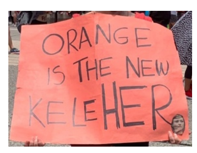
Figure 11. Sample of protest signage written in English