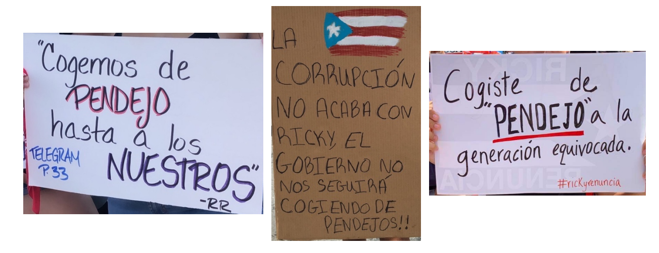
Figure 10. Sample of protest signage regarding intertextuality and corruption

rampant and well-known corruption schemes from this and past administrations. Although the comment refers to tricking "our own" (in regards to politicians), protestors took offense and expanded to Puerto Ricans treated like pendejos . This led to the youth movement La Generación del Yo No Me Dejo (Own translation: The "I Won't Yield" Generation), which was initiated in social media and promoted by Puerto Rican trap artist Bad Bunny. Rosselló's comment enraged the younger generations, which in turn declared that he tricked the wrong generation ( Cogiste de "pendejo" a la generación equivocada ).