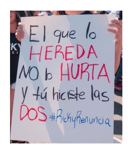
Figure 7. Sample of protest signage regarding Ricardo Rosselló's father