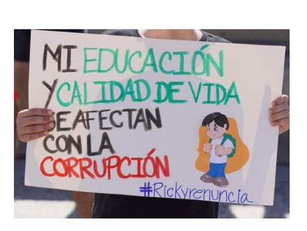
Figure 6. Sample of protest signage regarding the crisis in the Department of Education