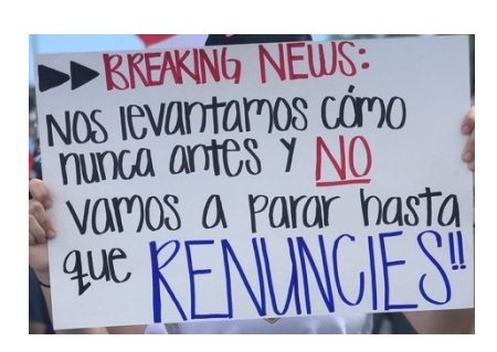
Figure 1. Sample of protest signage regarding call for revolution and resistance